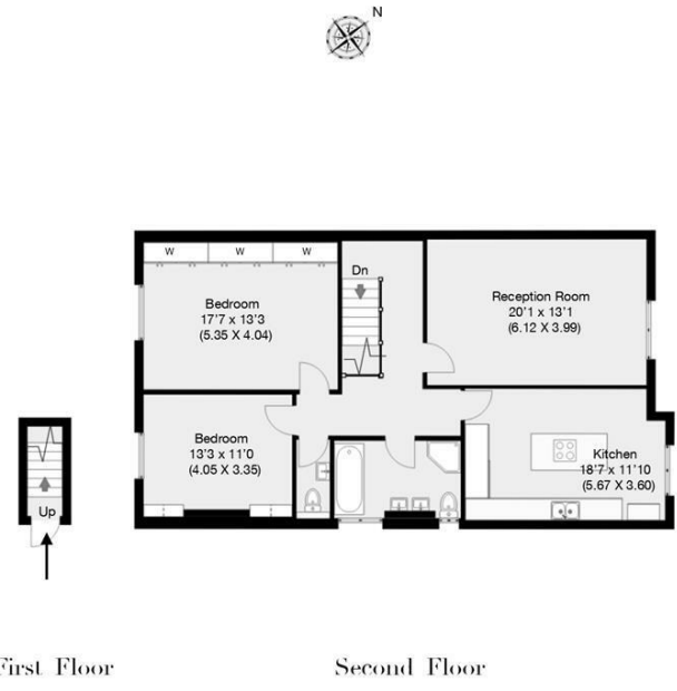
First Floor Second Floor

THIS FLOOR PLAN IS PRODUCED FOR PARKHEATH SUBMITTED BY ARCHIMEDIA web: www.archi-media.co.uk Whilst every attempt has been made to ensure the accuracy of the floor plan contained here, measurements of doors, windows and rooms are approximate and no responsibility is taken for any error, omission or misstatement. These plans are for representation purposes only and should be used as such by any prospective buyer or lease. Specifically no guarantee is given on the gross internal floor area of the property if quoted on this plan and any figures given is initial guidance only and should be treated as such.